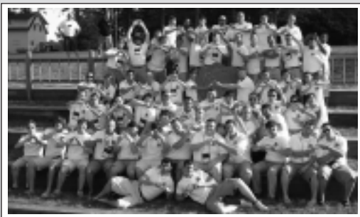
60 Graduates of the Charles R. Walgreen, Jr., TKE Leadership Academy XXII donate $2,000 before heading home.

So don't delay! Decide now that you will talk with your attorney about a will and an estate plan. And before you do, feel free to contact a TKE Educational Foundation representative that can offer suggestions that can add to the effectiveness of your estate plan.